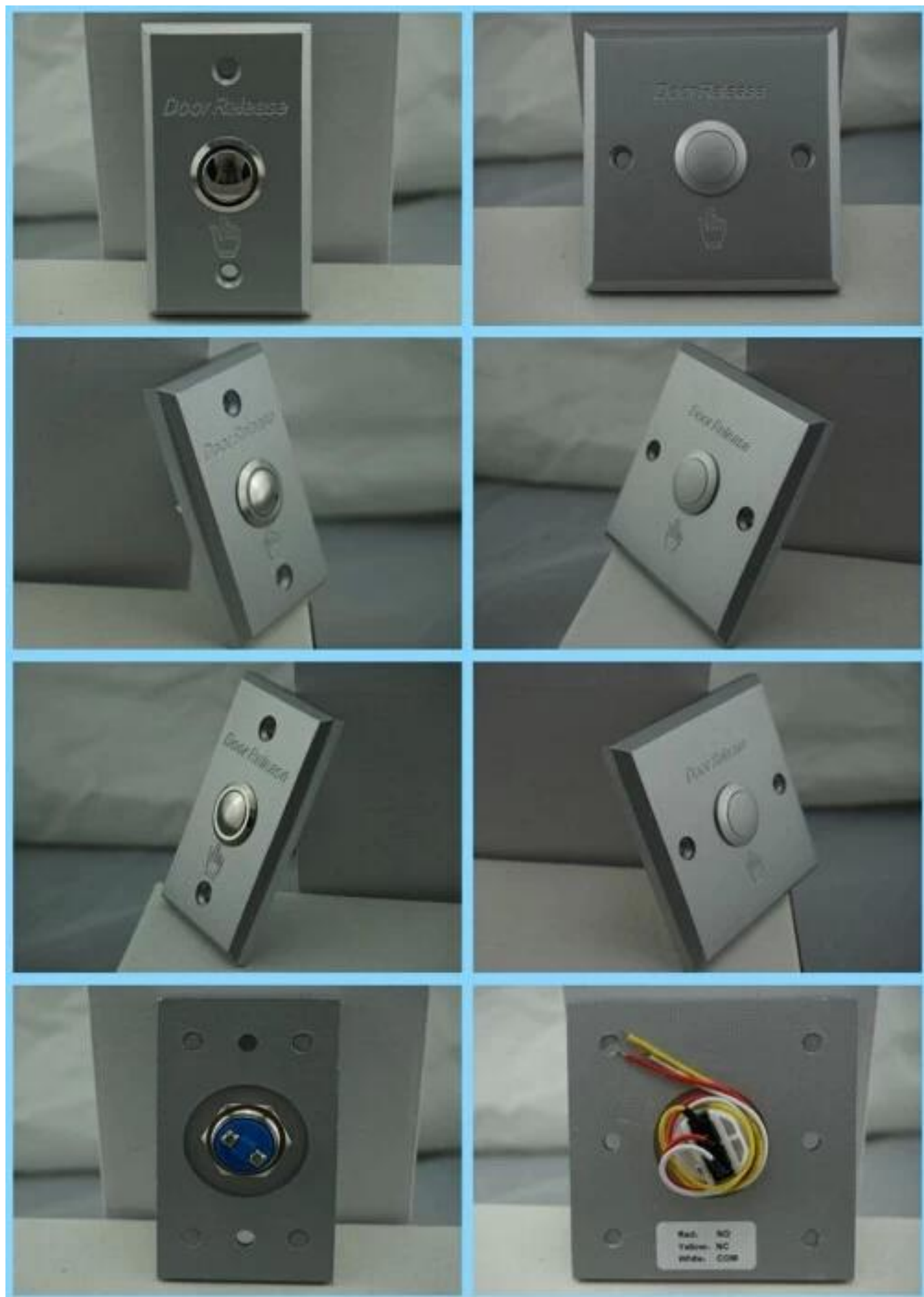
Door lock release button with the material metal and stainless steel