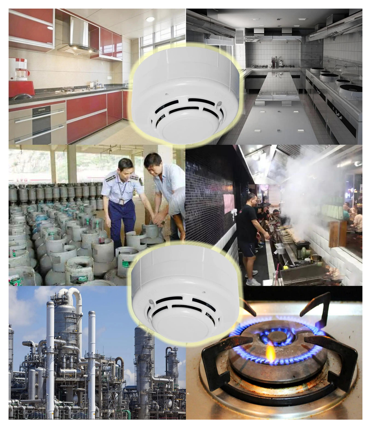
This kind of wired gas detector is suitable for Kitchen, barbecue, charcoal heating, gas station etc.