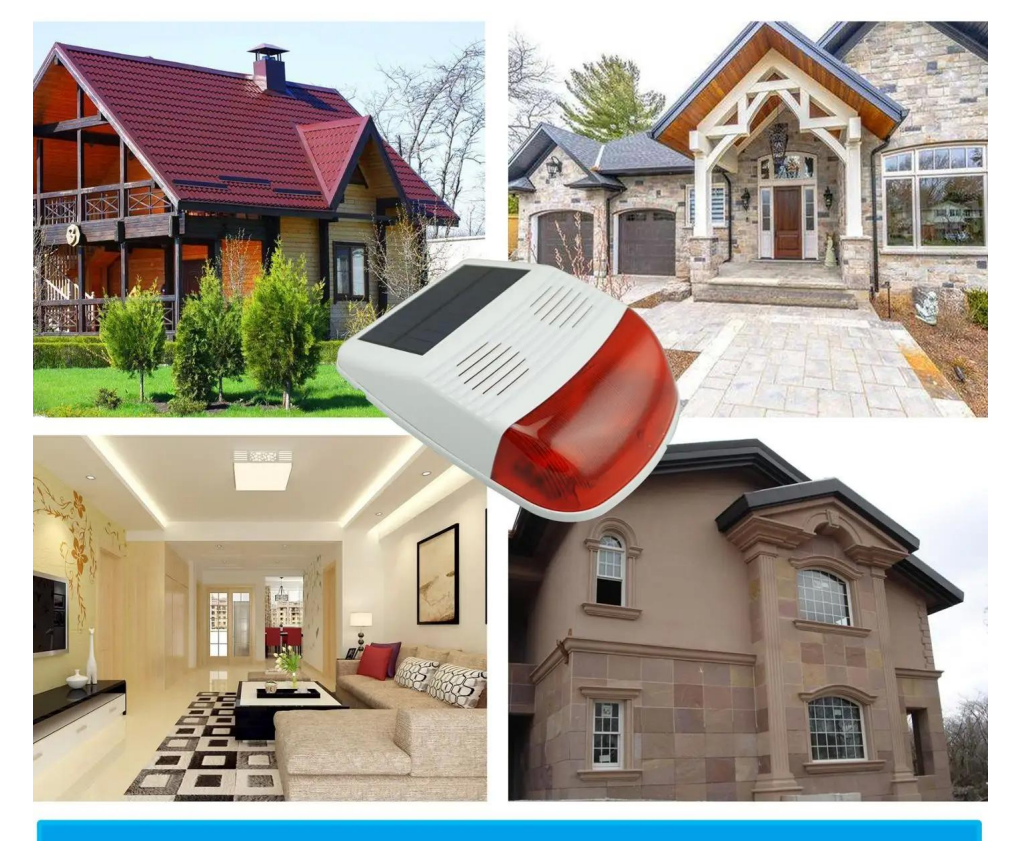
This model wireless GSM solar siren is wildly use in Villa, Home, Small house for Anti-theft and home security purpose.