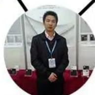
2013 shen yang Fair