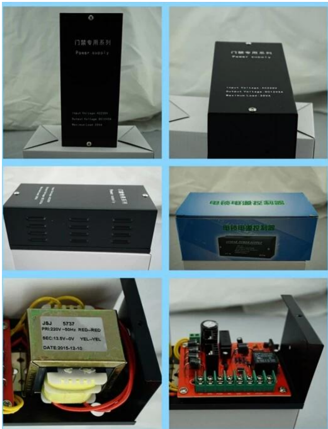
waterproof uninterruptible power supply controller China used with door access control system unit.