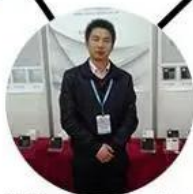
2013 shen yang Fair