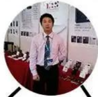
2012 shen yang Fair