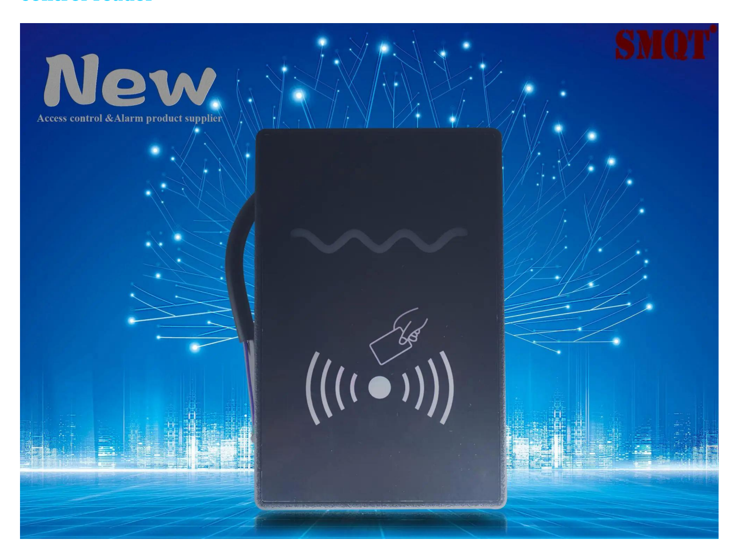
WHAT DOES EA-62 LOOK LIKE?