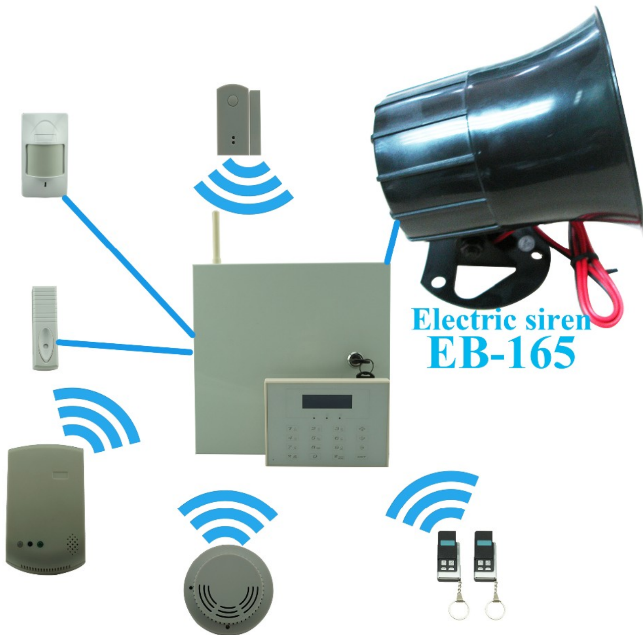
Electric siren EB-165