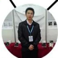
2013 shen yang Fair