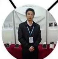
2013 shen yang Fair