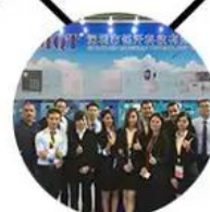
2015 Shenzhen Fair