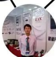
2012 shen yang Fair