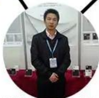
2013 shen yang Fair