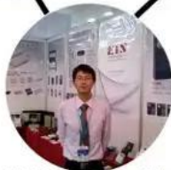
2012 shen yang Fair