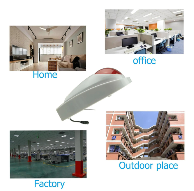
Suitable for all kinds of wireless burglar alarm and fire alarm system.