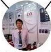
2012 Shenyang Fair