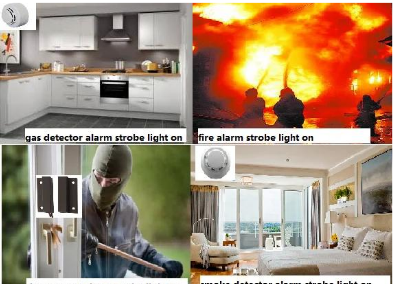
door sensor alarm strobe light on