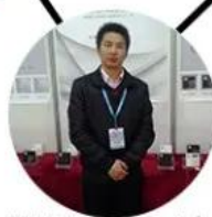
2013 shen yang Fair