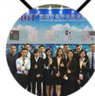
2015 Shenzhen Fair