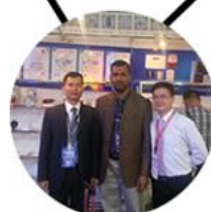
2013 Shenzhen Fair