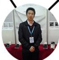
2013 shen yang Fair