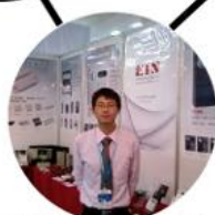
2012 shen yang Fair