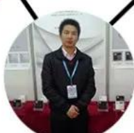
2013 shen yang Fair