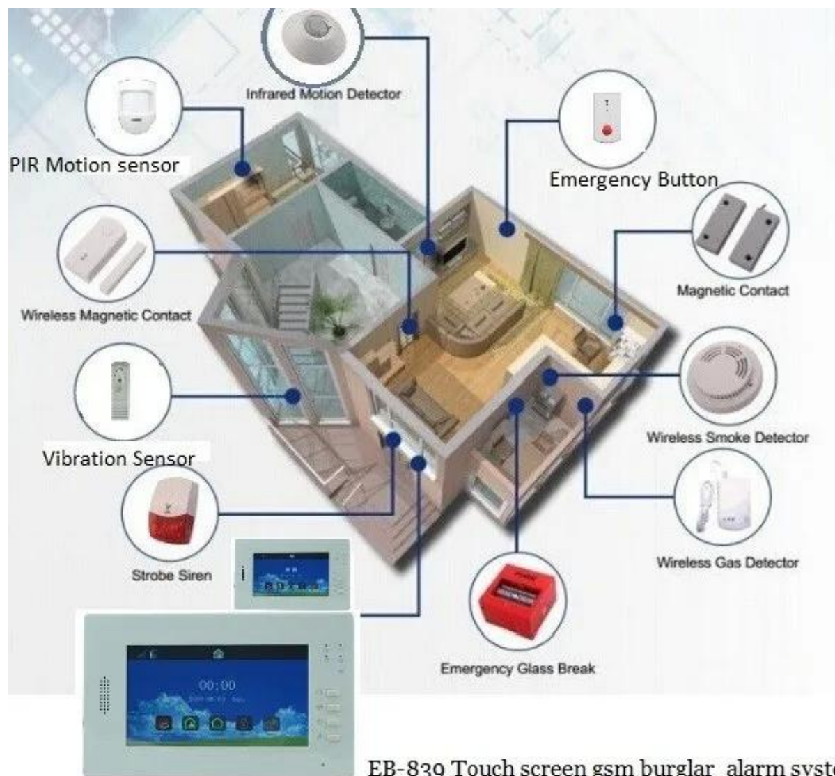
EB-839 Touch screen gsm burglar alarm system with CID monitoring dial