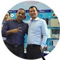
2011 Brazil Fair