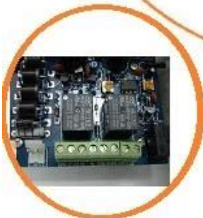
PCB of power