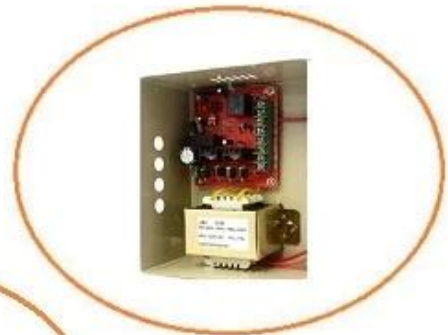
Packaged of power supply