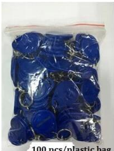
100 pcs/plastic bag