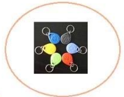
Key tag colors