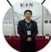
2013 Shenyang Fair