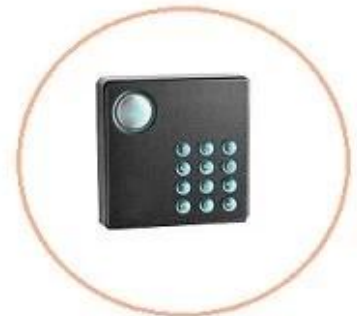
WG card reader