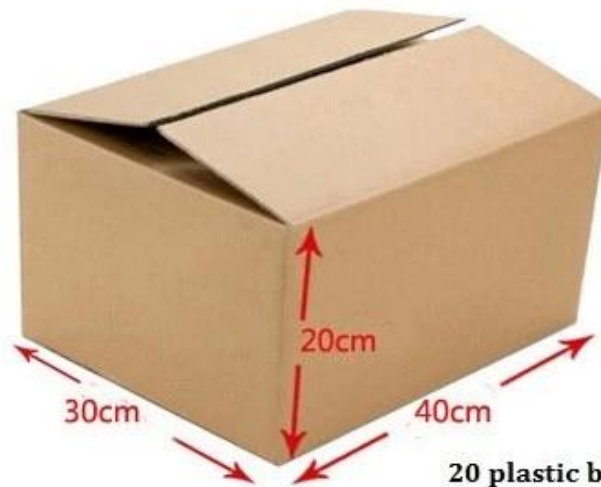
20 plastic bags/carton