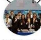
2015 Shenzhen Fair