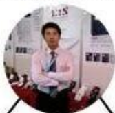
2012 Shenyang Fair