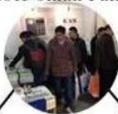
2013 Jinan Fair